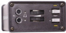
BP116 / 117