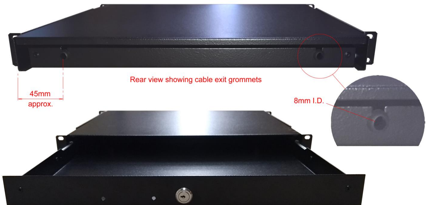
Rear view showing cable exit grommets

Pack of M6 rack bolts, cage nuts & washers.