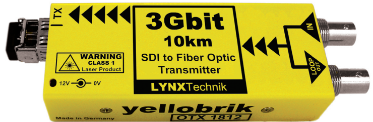
OTX 1812 LC Version Shown

The OTX 1812 will auto-detect any connected video signal from 270Mbit/s to 3Gbit/s according to SMPTE 424M, SMPTE 292M and SMPTE 259M standards, as well as DVB-ASI.