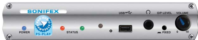
Fig 3-1: PS-PLAY Front Panel.

The rear panel has 2 x RJ45 connectors, one for the 10/100Mbit Ethernet interface and one for GPIO connections. The PS-PLAY has 2 output relay contacts which can be triggered remotely over IP from a connected PS-SEND unit. There is a 9 way D-type RS232 serial connection for control of the unit by automation systems and for firmware updates. The unit can be remote controlled via serial connection, TCP or UDP and remote management of the unit is also possible using SNMP traps.