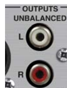
Fig 3-9: PS-PLAY RCA Phono Analogue Outputs.