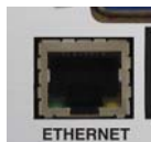
Fig 3-14: PS-PLAY ETHERNET Port.