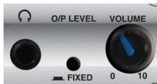
Fig 3-6: PS-PLAY Headphone Socket, Volume Control & Output Level Control.

The headphone output has its own volume control and has a maximum output level of +12dBu.