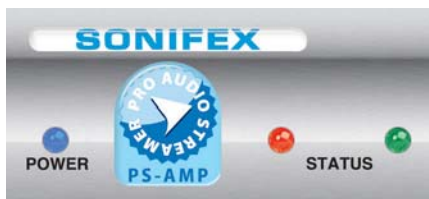
Fig 4-2: PS-PLAY Power & Status LEDs

There are two LEDs, red and green, which together indicate boot up errors and when data is being received. The LEDs have the following meanings: