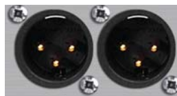
Fig 3-8: PS-PLAY Analogue Outputs