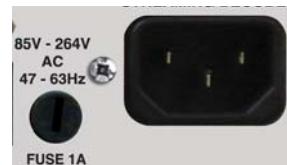
Fig 4-11: PS-AMP IEC Power Plug & Fuse.

The fuse socket is a where the anti-surge fuse 1A 20 x 5mm fuse is inserted. Please unplug the unit whenever opening this cover.