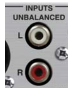
Fig 2-7: PS-SEND RCA Phono Analogue Inputs.