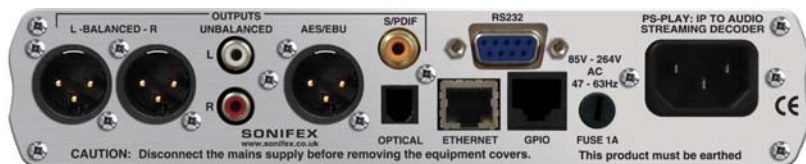
Fig 3-7: PS-PLAY Rear Panel.

All audio connections are outputs on this unit.