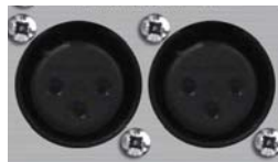
Fig 2-6: PS-SEND XLR Analogue Inputs.