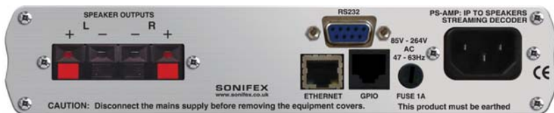
Fig 4-7: PS-AMP Rear Panel.